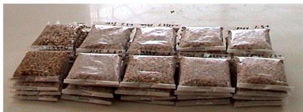
Fig. 1. Polyethylene bags containing grains treated with the tested pesticides as dusts.