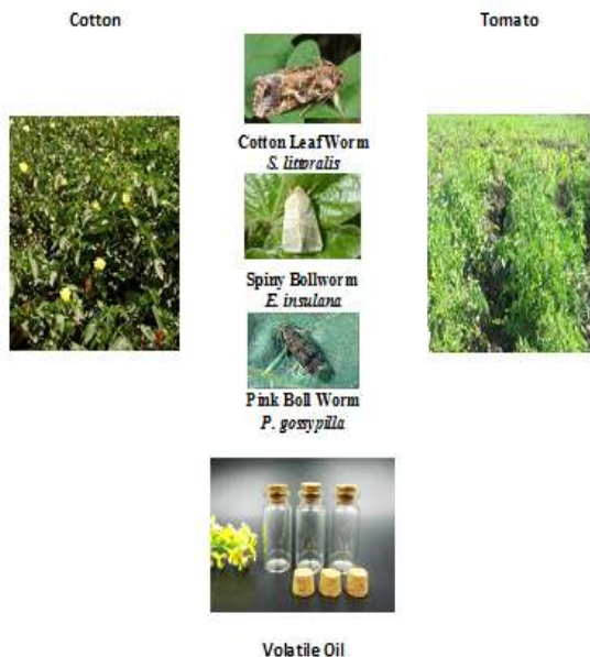
Fig. 1. Isolation and evaluation of cotton and tomato volatiles oils to major pests.

Spodoptera littoralis (Boisd.), estimated a positive response to cotton leaves about 76.6 %, the highest number of moths attracted were 80, 56.6 and 50 % by the tomato varieties “Bs”,“Alissa” and “Real Madrid”. Data in Table 3 showed that the number of S. littoralis females attracted were respectively 0.56 \pm 0.09 , 0.53 \pm 0.14 and 0.44 \pm 0.08 for “Real Madrid”“Alissa” and “Bs” of tomato varieties.