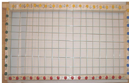
Fig. 1. Frame to calculate the number of stored pollen

This frame was laid against any comb to count the number of stored pollen (Fig 1).