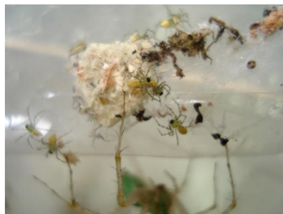
Figure (3): Spiderlings

From the previous egg sacs, 111 individuals hatched and emerged through a round pore at the tip of the egg sac (fig.3), they were reared under laboratory conditions. Only 41 of them reached maturity and completed the life cycle.