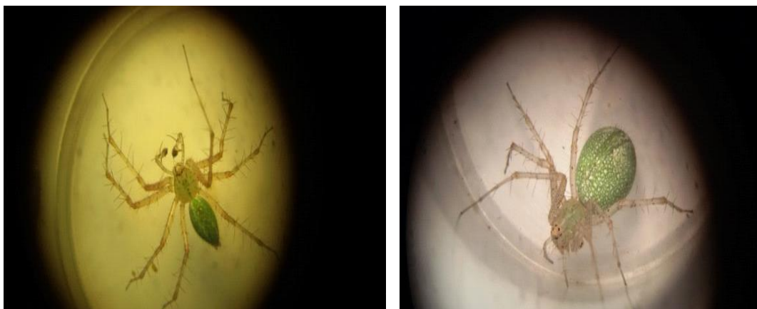
Figure (4): Adult Male and Female