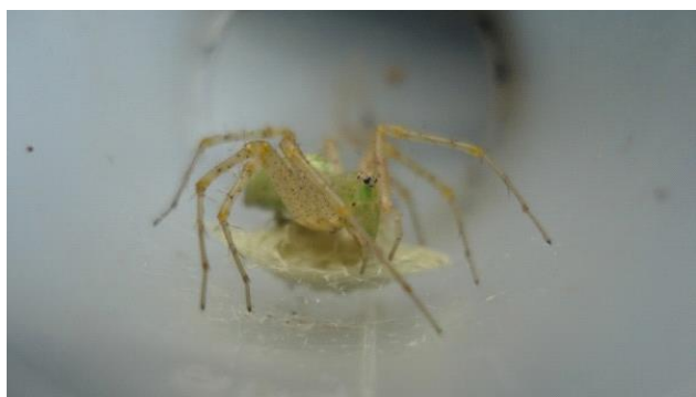
Figure (2): Adult female guarding the egg sac

The incubation period of eggs of P. arabica lasted 31 and 35 days for the first egg sac while the second one, the incubation period lasted after 20 and 25 days respectively.